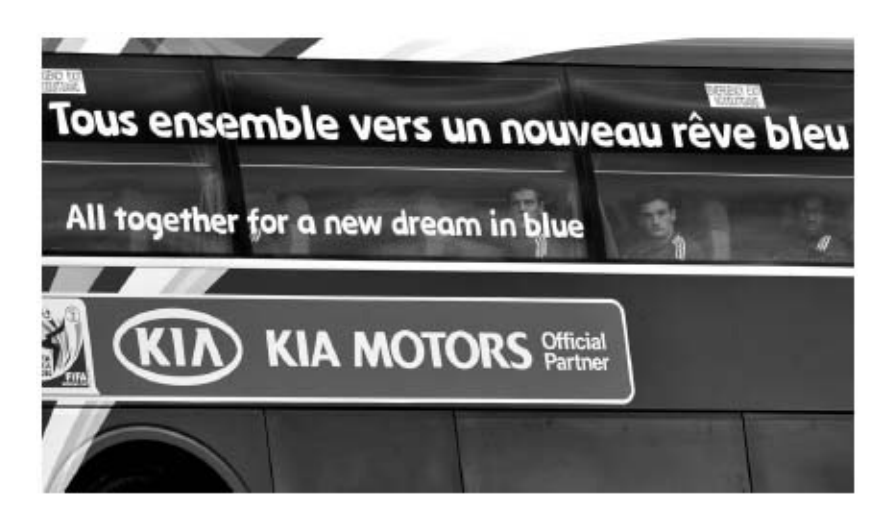
'The bus of shame'. Driver: R Domenech.