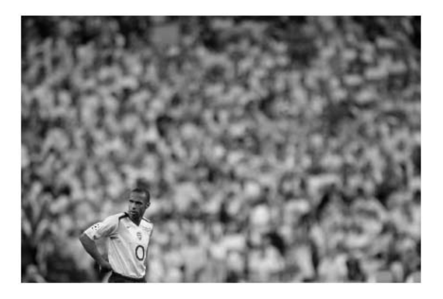
Love hurts. Champions League final, Paris, 2006.