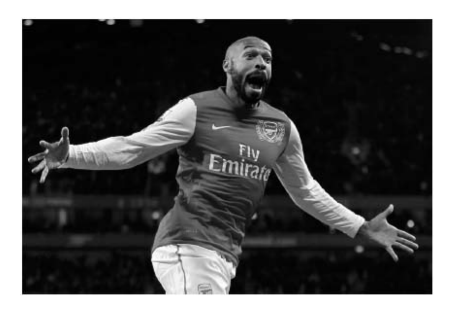
Unmasked, unhinged, beautiful.