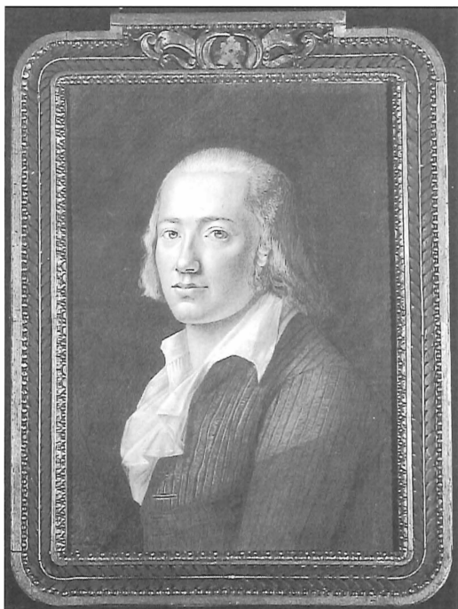
Friedrich Hölderlin (Schiller Nationalmu- seum, Marbach am Neckar)