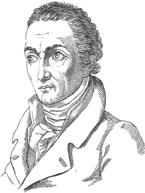
H. E. G. Paulus