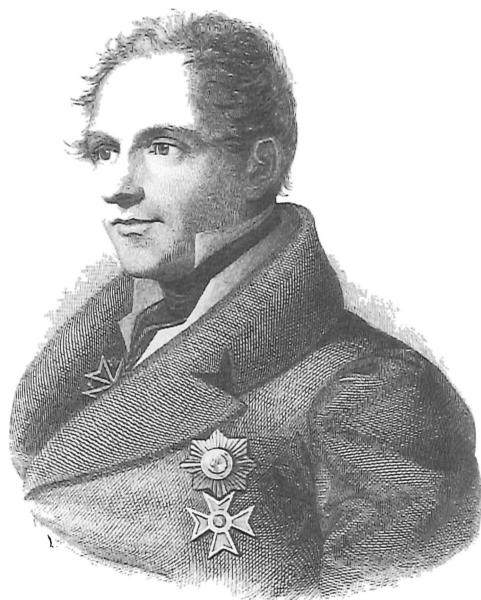
K. A. Varnhagen von Ense