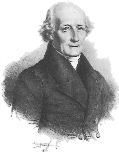
Immanuel Niethammer