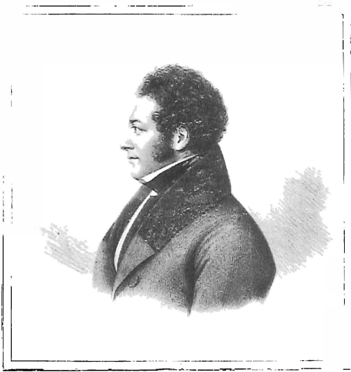
DR. EDUARD GANS Professor der Rechte an der Universität zu Berlin. 1815. 10. 25

Eduard Gans