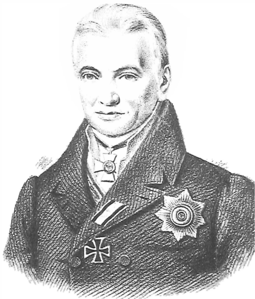
K. S. von Stein zum Altenstein