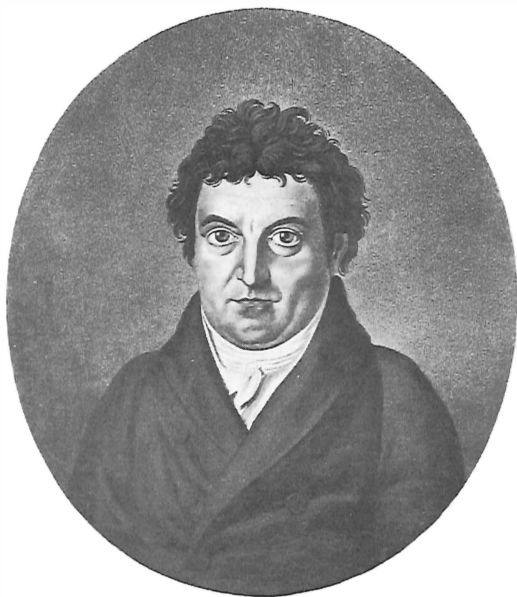
J. G. Fichte (Archiv für Kunst und Geschichte)