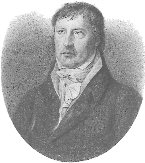
Hegel: portrait by Bollinger after Chris- tian Xeller