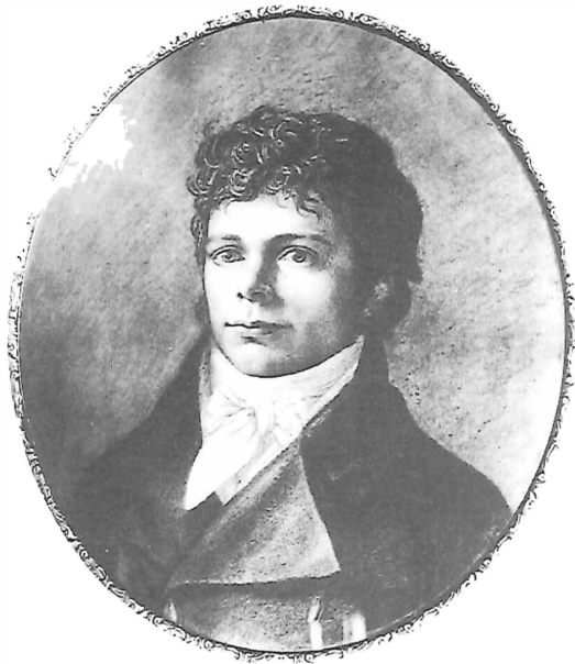
F. W. J. Schelling