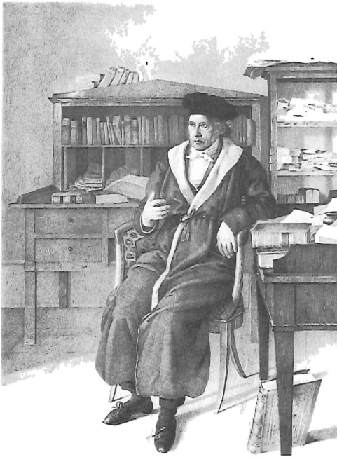
Hegel: lithograph by L. Sebbers (Hegel-Archiv der Ruhr-Universität Bochum)