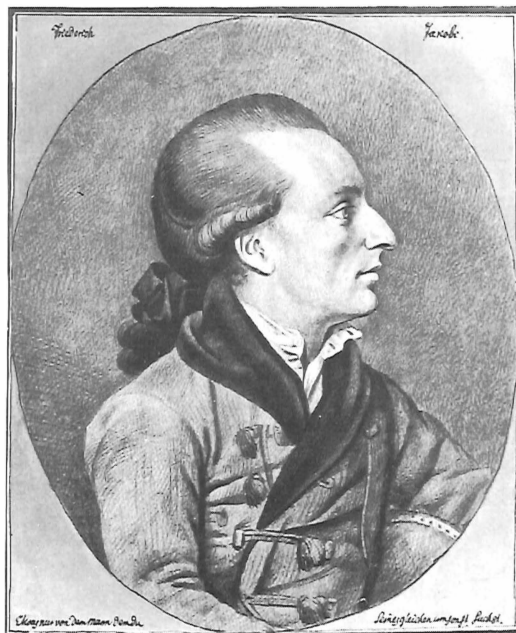
F. H. Jacobi