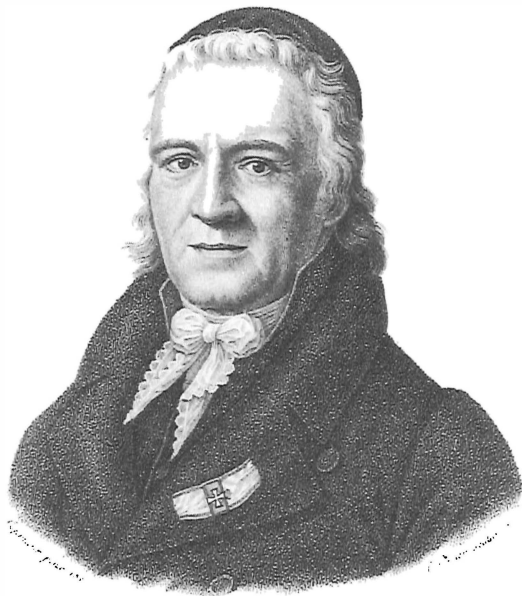
K. L. Reinhold