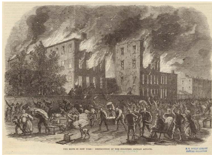
Depiction of the July 13, 1863 attack on the Colored Orphan Asylum.

Douglass, who considered McCune Smith the most important Black influence on his life, asked him to write the Introduction to his book, My Bondage and My Freedom , published in 1855. In addition, Douglass invited McCune Smith to become the New York correspondent of his new newspaper, Frederick Douglass' Paper , in which he was given free rein to write on any topic of his choosing.