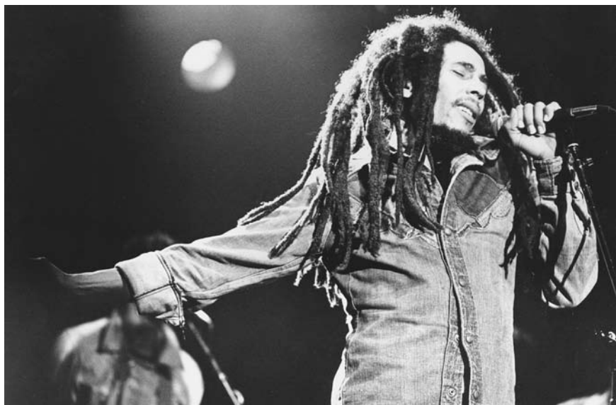
Bob on stage wearing his signature denim shirt in 1976.