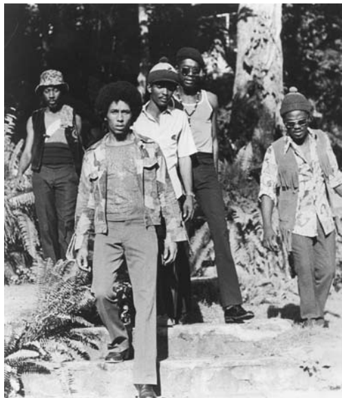
The Wailers: (from left) Bunny, Bob, Carlie, Peter, and Aston ca. 1971.