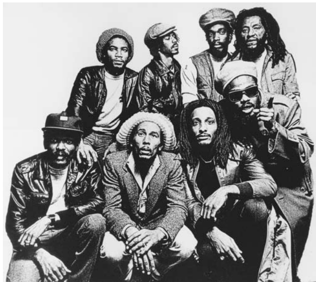
The Wailers in 1980.