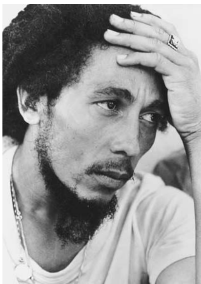
Bob in a contemplative mood in 1978.