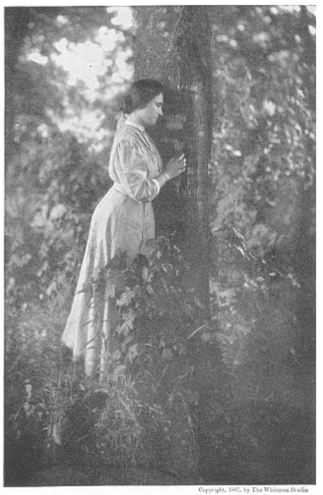
"Listening" to the Trees To face page 70

in tufts of grass, the silky swish of leaves, the buzz of insects, the hum of bees in blossoms I have plucked, the flutter of a bird's wings after his bath, and the slender rippling vibration of water running over pebbles. Once having been felt, these loved voices rustle, buzz, hum, flutter, and ripple in my thought forever, an undying part of happy memories.