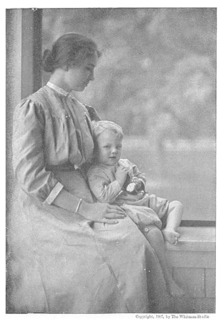
The Little Boy Next Door To face page 120

kitten at play. I have known the sweet, shy ways of little children. I have known the sad opposites of all these, a ghastly touch picture. Remember, I have sometimes travelled over a dusty road as far as my feet could go. At a sudden turn I have stepped upon starved, ignoble weeds, and reaching out my hands, I have touched a fair tree out of which a parasite had taken the life like a vampire. I have touched a pretty bird whose soft wings hung limp, whose little heart beat no more. I have wept over the feebleness and deformity of a child, lame, or born blind, or, worse still, mindless. If I had the genius of Thomson, I, too, could depict a "City of Dreadful Night" from mere touch sensations. From contrasts so irreconcilable can we fail to form an idea of beauty and know surely when we meet with loveliness?